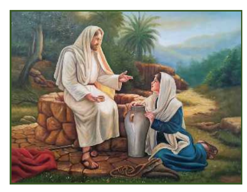
Zion Fine Arts

Prayer: I never met the Samaritan woman, but I thank you, God, for her faith, for her passion to share the gospel, so that even now her faith continues to inspire faith in others. Like the Samaritan woman, may we be transformed often by Jesus Christ, so that we cannot help but proclaim that he is, indeed, the Savior not only of Jews, not only of Samaritans, but the whole world/cosmos. Amen.